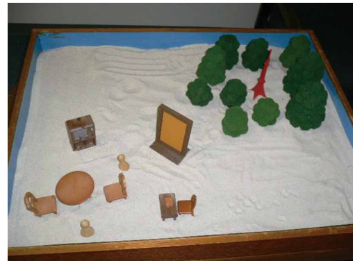
Fig. 3-2-5 Visible and invisible world

I had been imagining if there could be the peaceful bond between Christianity and Buddhism, but at that time our inner voice might suggested that “The time has not come yet”.