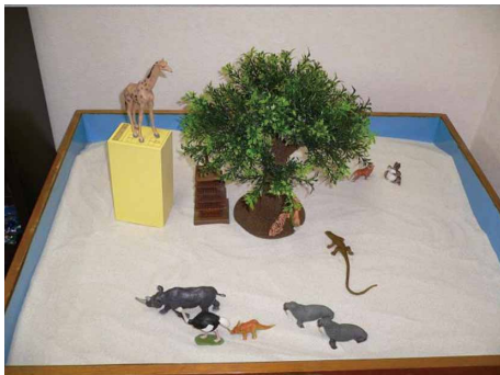
Fig. 3-1-2 A giraffe on a high building near the temple

In this sand-play, the animals moved from right to left which sometimes represent the inner movement from outside to inside, or from society to home. There is a small resting hut (tea-room) on the way, which could symbolize my counseling room. The red bridge is often set on the pond of a Japanese shrine which connects this world and another.