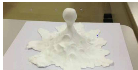
Fig. 2-2 Being born

Another one is made by a young lady and the title was "Being born" (Kuramitsu, 2019).