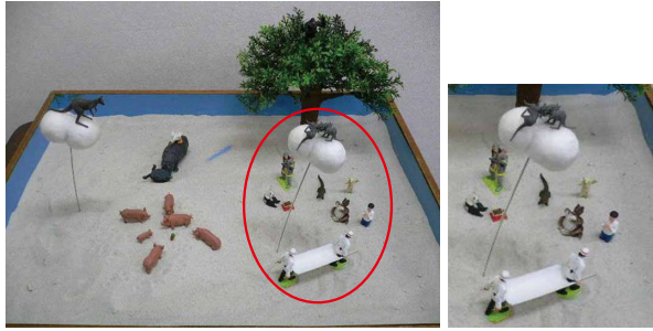
Fig. 3-1-6 Kangaroos on the cloud may fall down but there waits rescue team with a stretcher

The next sand-play work expressed kangaroos balance upon unstable clouds. They might fall down but there waits a rescue team with a stretcher. There is a man praying and a raccoon looking above who may represent the client and the therapist. This work suggests that he would be saved even if he dropped out of the university.