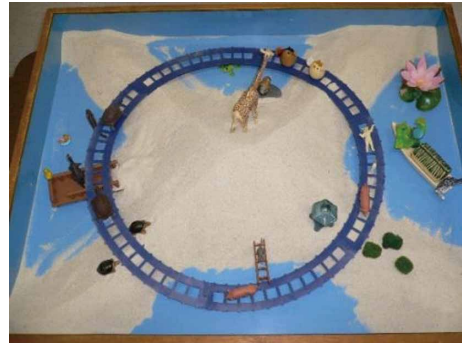
Fig. 3-1-9 A giraffe moved to the center of mandala

During this critical period, he decided to leave the university. In the sand-play work, giraffes are going to pass the bridges from left to right. I guess this movement reflects his journey from dangerous field to peaceful land.