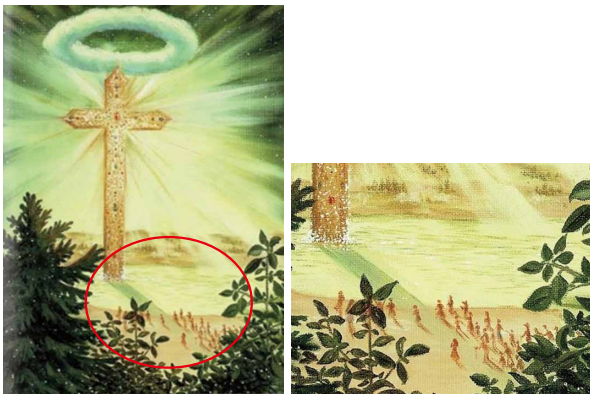
Fig. 1-2 Victims of Titanic accident

In this train, the victims of the Titanic accident were also riding. They got off at a station where a big cross was standing. And there came forward a man in white cloth with his hand open, and the victims were moving toward the cross with cheer.