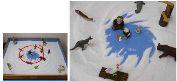
Fig. 3-1-4 The panda and an old man talking at the hot spring

In the next work, there emerged Buddha in a pond and near him a small panda on a boat. I felt this composition looks like our counseling room where clients come and get rest for a while. And a duck on dinosaur also may represent the client who clings on to the reliable therapist.