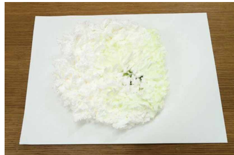
Fig. 2-1 Buds emerging from snow land

The first one was made by an old lady. She was told by her doctor that she only had one year left of life. She was deeply hurt but she decided to take my class, which would be held one year later from this date. When I met her, she looked rather healthy but of course had not been cured. After the session, she confessed to us her situation and told that this class was what she really needed at this university.