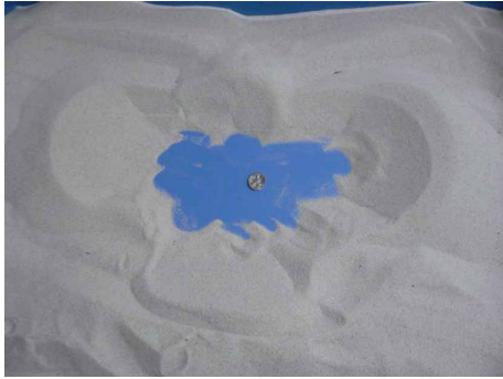
Fig. 3-2-7 A precious coin at the bottom of the sea

At the next session, he made the bottom of the deep sea (which looks like the well above), where lied one precious coin. As the sea is so deep human being can not find it, while fishes can see it, but it is worthless for them. We realized again that there is an invisible world.