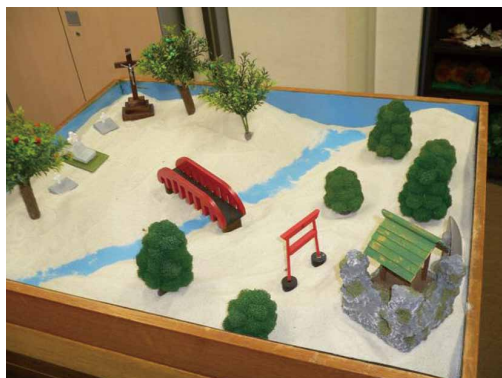
Fig. 3-2-4 Two religious zone first connected then divided