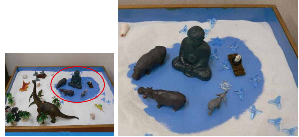
Fig. 3-1-3 Buddha and a panda in a pond

At the next session, he made the work of a giraffe on a high building, who cannot move freely. This building may represent the high-level university, and the giraffe on the top may represent his crisis. And there is a tiger under the tree that may attack him. Yet, you see a Buddhist temple between the building and the tiger.