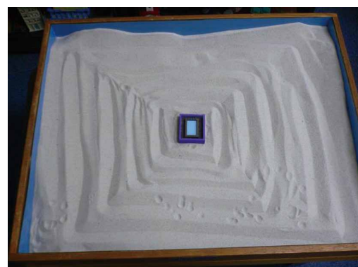
Fig. 3-2-6 Mandala shape desert and the central well

Jiro commented that the next sand-play ( Fig. 3-2-5 ) had a deep connotation. He commented that there is a visible and invisible world. In the left space you see the real room with a TV. But no one knows that there is a small TV in the big TV set. Special waves come from red tower and this small TV catches the waves from the tower, but no one is aware of that. And if the person in the room opens the door to the outside, the world of the tower and the woods disappear. He realized the fact that the source of waves is invisible though it conveys some message to us.