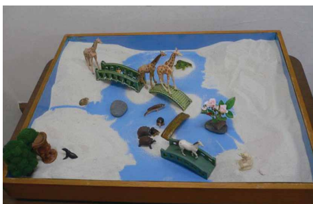
Fig. 3-1-8 Giraffes passing bridges from left to right

And yes, a kangaroo was brought to rescue through the arch of a rainbow in a session several months later.