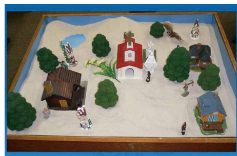
Fig. 3-2-2 Mary, church and the graveyard

He made a sand-play work where a ship moves from left to right, which may reflect the inner journey from the past to the future.