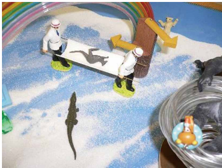
Fig. 3-1-7 A kangaroo was saved on stretcher

The next sand-play work expressed kangaroos balance upon unstable clouds. They might fall down but there waits a rescue team with a stretcher. There is a man praying and a raccoon looking above who may represent the client and the therapist. This work suggests that he would be saved even if he dropped out of the university.