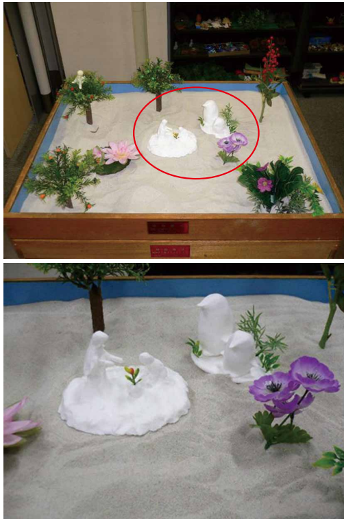
Fig. 3-2-3 Two couples of mother and child, while the Little Prince looking at the situation from the tree

On the left side, he said someone was buried, so he placed some flowers for her. I felt this grave might represent the psychological death of his important person.