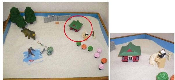
Fig. 3-1-5 The panda prays to a shrine